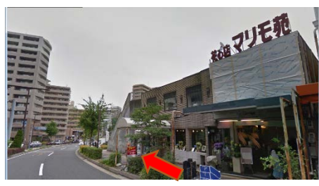
② Go seeing Red Cross Hospital on your right