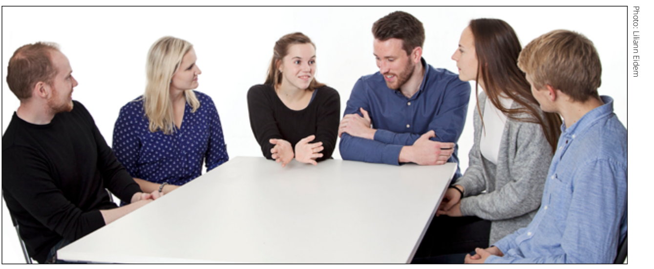
Specific teamwork situations form the basis for the process report.

criteria for the reports (see pp. 21-22) and expectations regarding these expectations or to describe them in more detail.