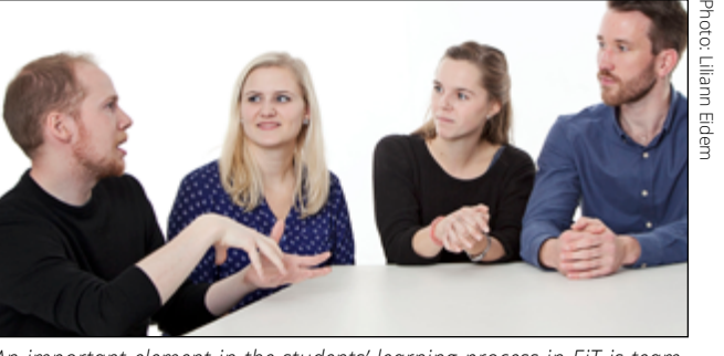
An important element in the students' learning process in EiT is teambased reflection on the interaction in the team. To perform well, the team must present the individuals' reflections on the teamwork situations.

The reflections of the team should be supported by specific examples or situations. They can reflect on different types of teamwork situations, both when cooperation is working well and when challenges arise. It may be difficult to reflect on the reasons for good teamwork and to