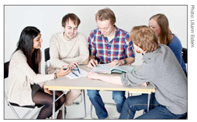
During the first two village days, the student team writes a cooperation agreement that must be signed by everyone in the team.

The village supervisor must approve the teams' cooperation agreements.