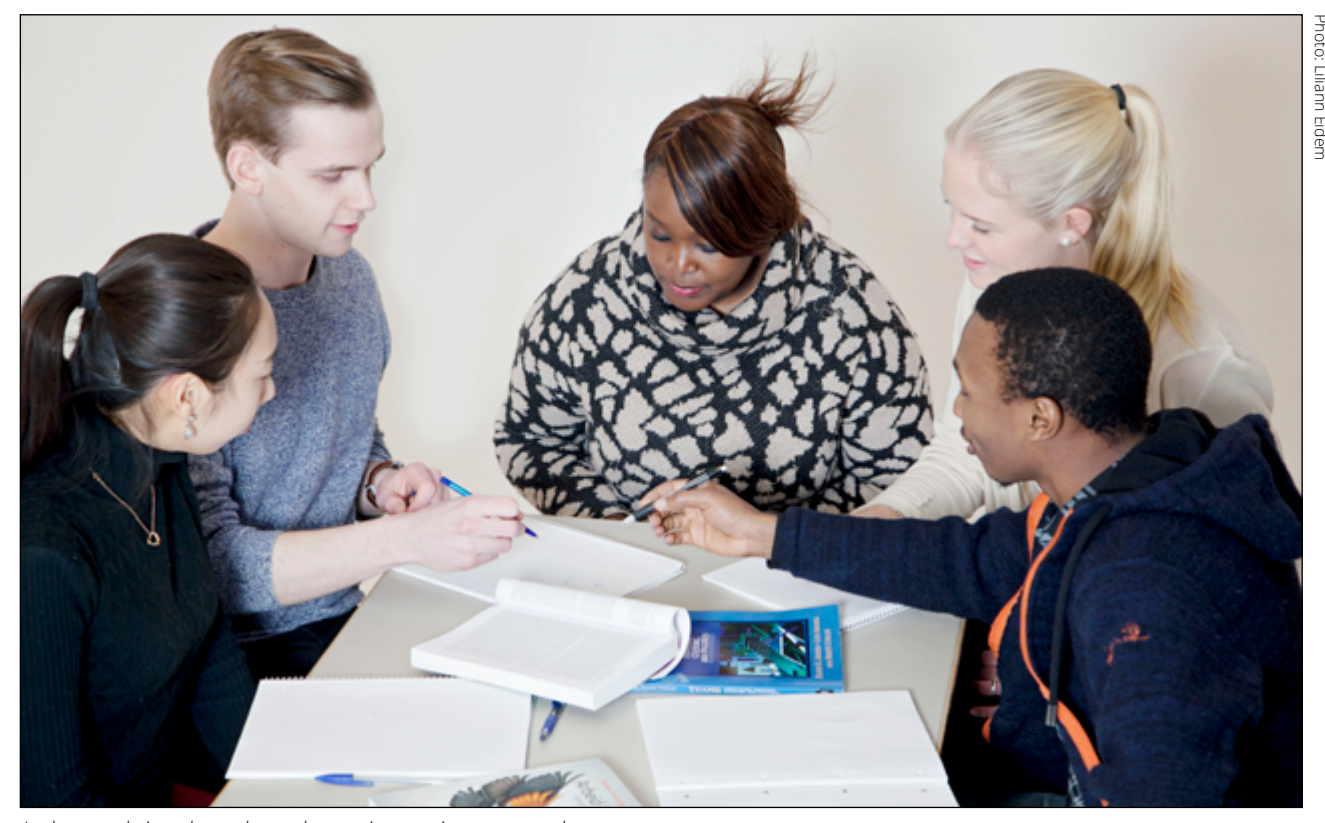
In the completion phase, the students write a project report and a process report.

Each student team must submit one project report and one process report. Together, the reports must show what the students have been working on, and how they have developed collaborative skills in their interdisciplinary teamwork. Descriptions of personal and relational issues must be collected in the process report, which will be a