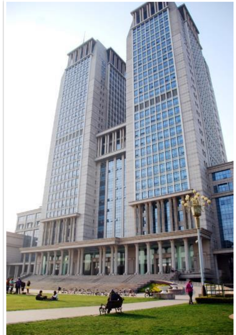
Guanghua Towers in Fudan University

FOR MORE INFO: http://www.fudan.edu.cn/englishnew/