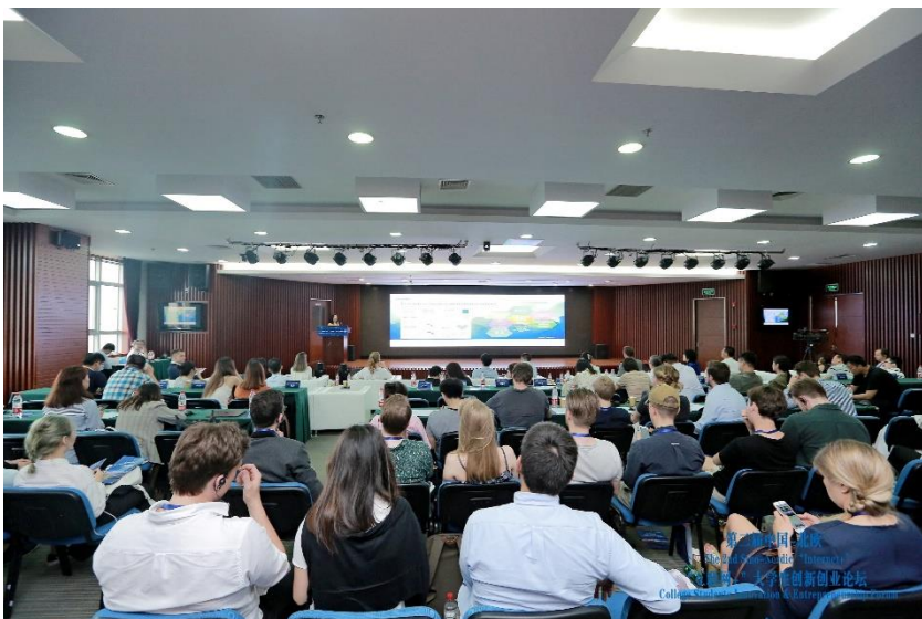
2020 Sino-Nordic “Internet +” College Students Innovation and Entrepreneurship Forum Business-idea pitching competition.